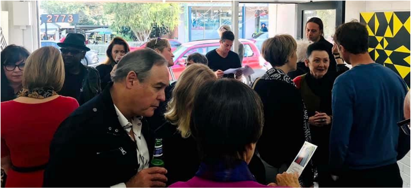
Colour Field Eleven Opening 2019 Anala Art Advisory

LISP - Artist Collective, Sydney / Frankfurt