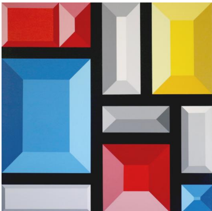
Messin' With Mon Acrylic on Canvas, 90 x 90cm 2019