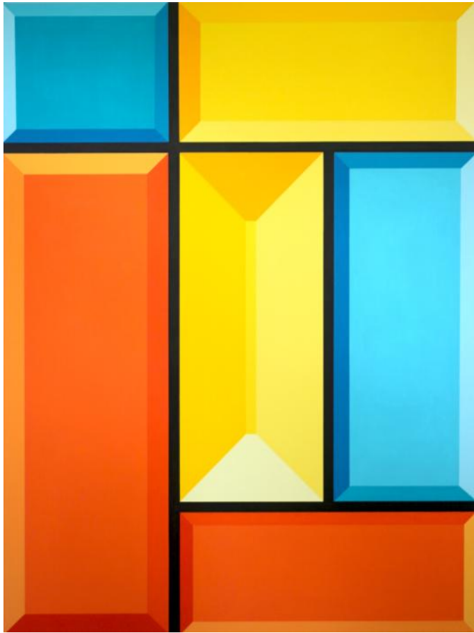
Pop Op Brady Acrylic on Canvas, 120 x 90cm 2019