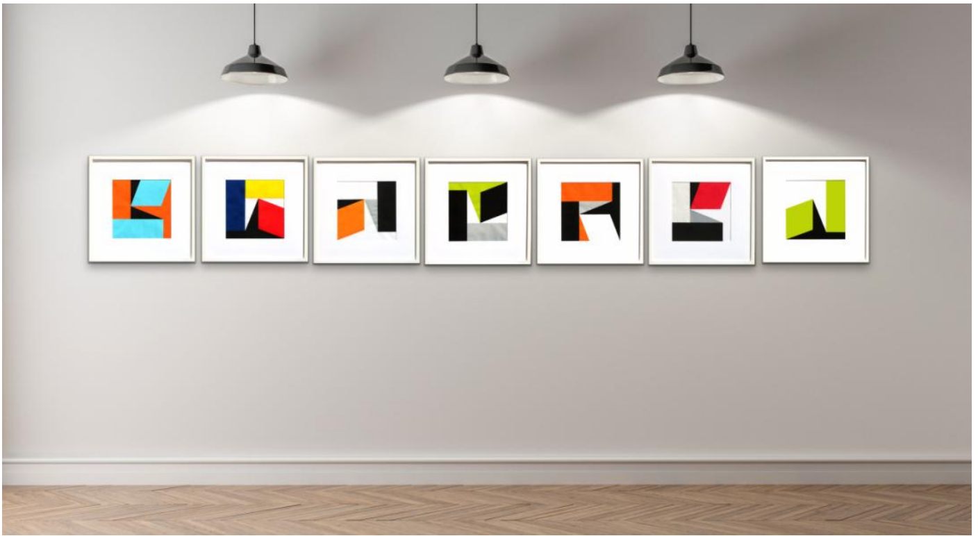
Plane Paper I - VII Block prints on Washi Paper 30 x 30cm. 2019