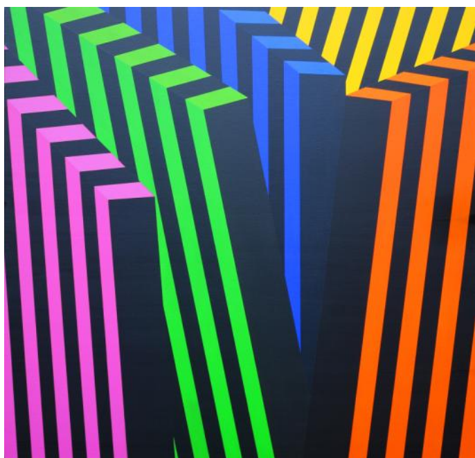
The Shakin' Starts Here Acrylic on Canvas, 90 x 90cm 2019